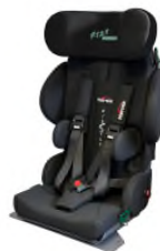
size 1 Black (300000-E3)