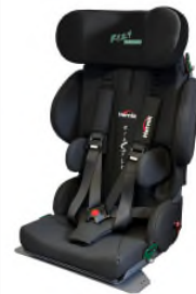
size 2 Black (310000-E3)

Technische Änderungen und Druckfehler vorbehalten.